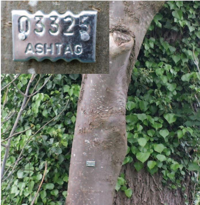
A tagged ash tree with a close-up of the tag.

senescence to ascertain baseline data. Once Chalara ash dieback reaches these trials, we hope that we will also find evidence of altered phenology to aid us in locating trees with a genetic resistance to the disease.